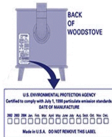
Permanent Wood Stove Label

Wood stoves offered for sale in the state of Washington must meet a particulate emissions limit of 4.5 grams per hour for non catalytic wood stoves and 2.5 grams per hour for catalytic wood stoves.